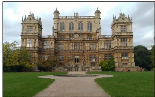
Figure 1 Wollaton Hall Nottingham

Wollaton Hall is an Elizabethan Mansion built to the same blueprint as Highclere Castle in Berkshire that features as the television Downton Abbey. It stands prominently on a sandstone hill in the centre of a 500-acre deer park. Beneath the Hall is an enormous example of what Dowsers call a Blind Spring. This is a vertical shaft of ascending water that does not rise to the surface of the earth but disperses through horizontal fissures producing dowseable energetic patterns over a wide area.