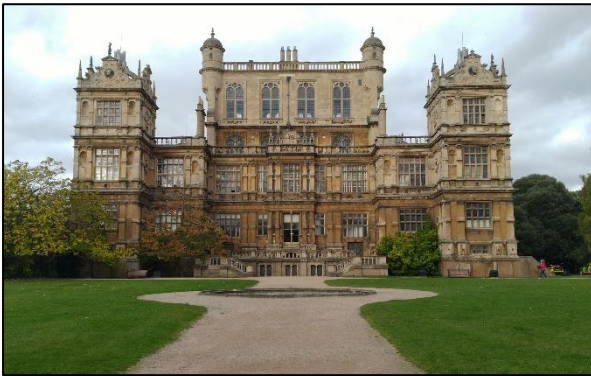
Figure 2 Wollaton Hall

The Wollaton children's comments that reminded me of the East Yorkshire ILFs included "When we looked up there was a light in the trees", "You could see them in the dark, they showed up", "Some up in the trees and some on the ground", "When we went to the trees, they went back in; when we went away from the trees, they come back out again", "When they come out, we seen a light in the trees hanging and we could see the faces", "They kept chasing us", "Very fast". "They don't come out in the light".